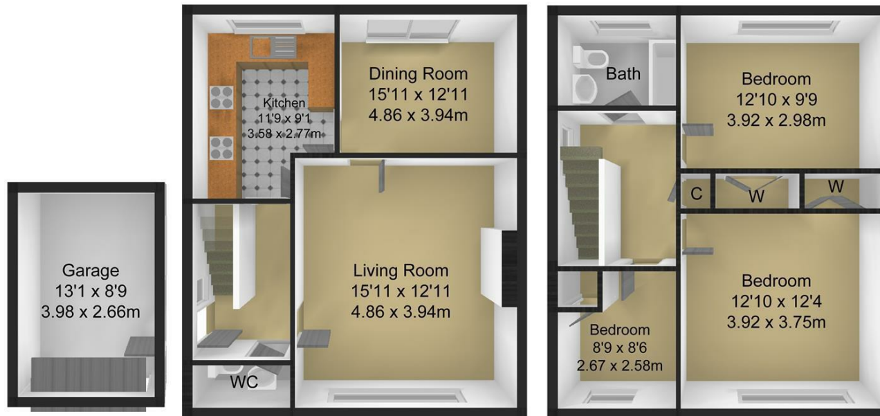
Garage Approx. Floor Area 663 Sq.Ft (61.1 Sq.M.)