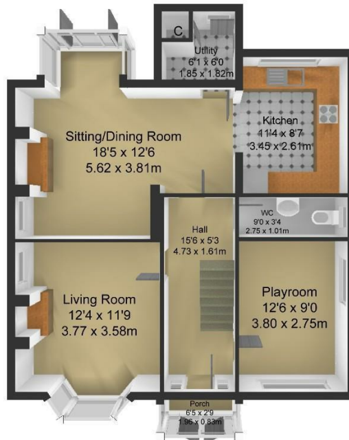
Ground Floor Approx. Floor Area 815 Sq.Ft (75.7 Sq.M.)