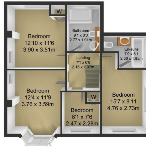
First Floor Approx. Floor Area 649 Sq.Ft (60.3 Sq.M.)