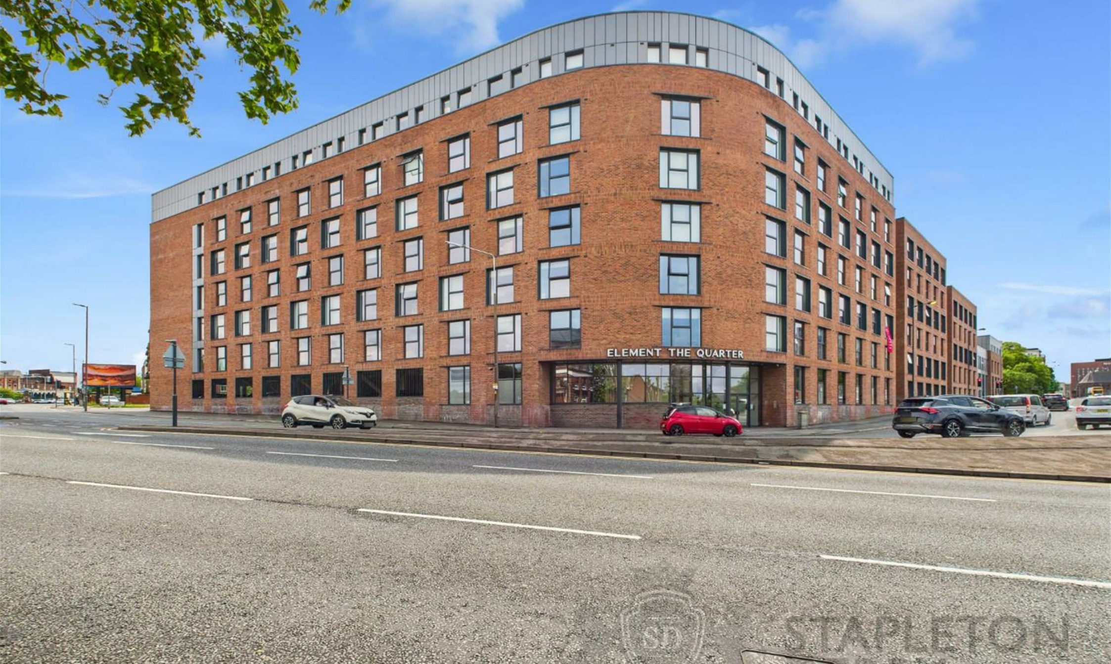
Element The Quarter, Liverpool 88 Low Hill, Liverpool, L6 1AZ £695 PCM